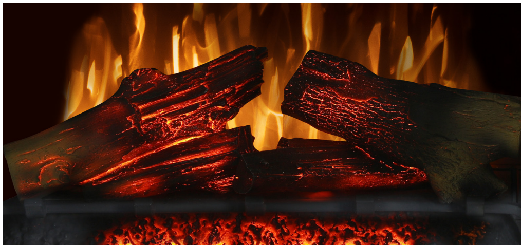
Detail of Log Set and Brick Panel

Visit us online! www.kathyirelandbygt.com